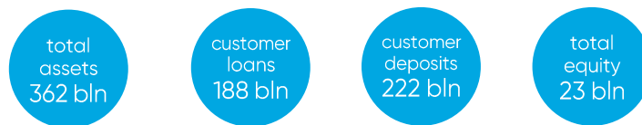
Data as at 30-06-2024